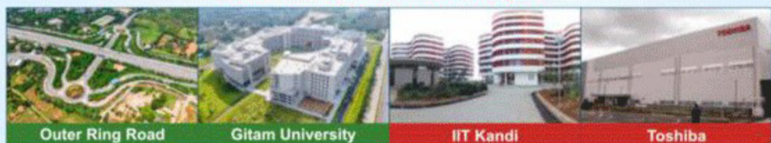
Outer Ring Road